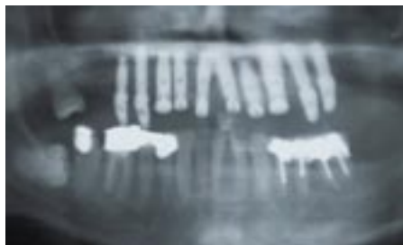
(Top:) Pre-op panoramic. (Bottom:) Post-op panoramic

placed Lifecore dental implants in position of teeth numbers 4, 5, 12 and 13, respectively. This case was temporized by re-cementing the existing bridge on the six anterior abutments. At this point, a roundhouse temporary shell was prepared to be used as a temporary, after removing the six anterior teeth and placing six anterior implants. We waited three months to allow for healing and osseointegration to take place.