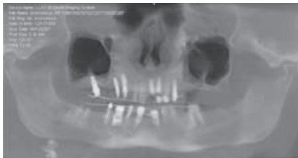
Second Post-op pano

SOME OF NEW YORK'S MOST INSPIRING LEADING LADIES WON'T BE FOUND ON A BROADWAY STAGE.