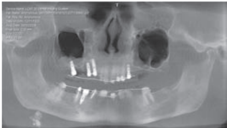
First Post-op pano

cedures had taken a psychological and emotional toll on this patient. He became extremely self-conscious. He never wanted to go out for dinner because it was too painful, too embarrassing and too uncertain. The patient’s lack of eating resulted in weight loss, with facial contour changes. On top of it all, he had lost his sense of taste as well. His daughter urged him to make an appointment for an implant consultation, and he finally agreed.