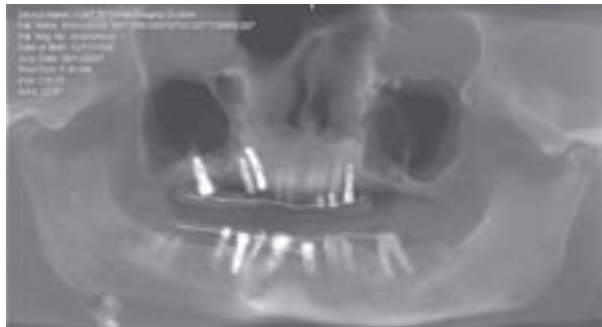
Second Pre-op pano

Since receiving his dental implants and lab-processed, round-house bridge, the patient has been living life again. His wife says that he is confident in social settings and he is enjoying food once again. His face is no longer sunken and his weight has returned, so he looks happy, healthy and well adjusted. ■