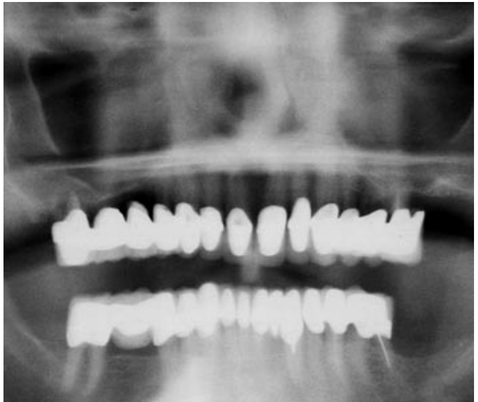
(Figure a:) Pre-op pano

The INFUSE Bone Graft product had previously received FDA approval for certain spinal fusion applications and tibial fracture repair procedures.